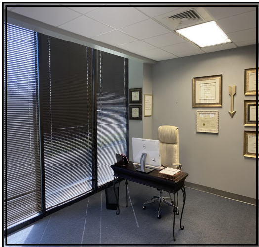
Private Office Space