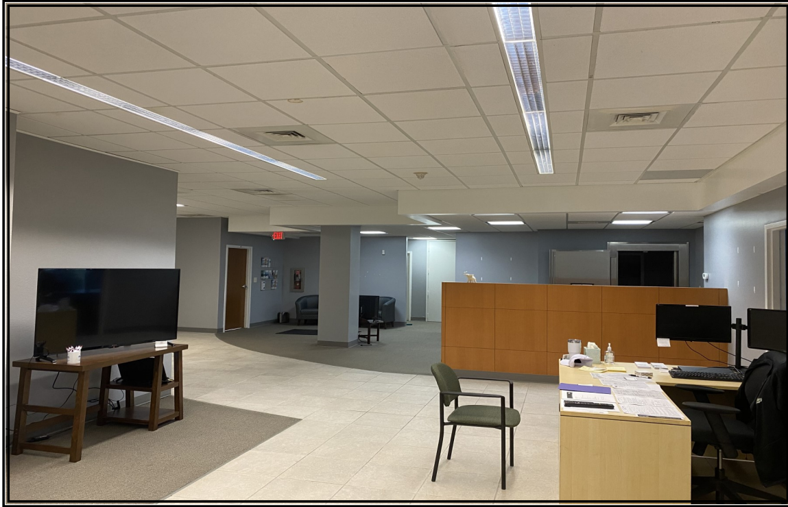
Main Office Space