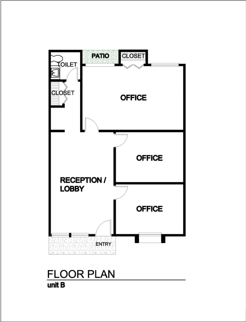
926 RSF Floor Plan

Southeastern Realty Group 933 Lee Road, Suite 400, Orlando, Florida 32810 407-629-5595 phone, 407-645-2035 fax Visit our website at www.southeasternrealty.com