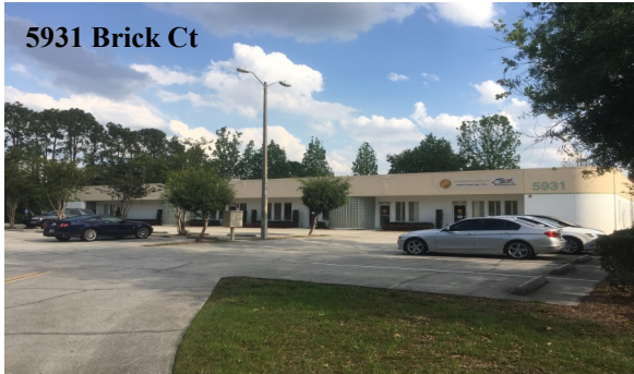
5931 Brick Ct

5931 & 6001 Brick Court, Winter Park, Florida 32792