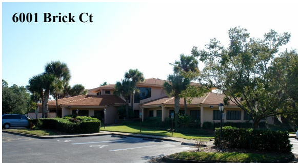
6001 Brick Ct